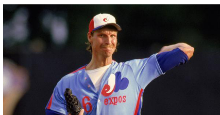
Randy Johnson pitching for the 1987 Jacksonville Expos.