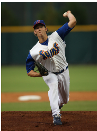
Clayton Kershaw with Jacksonville