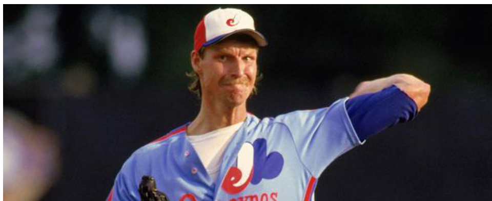
Randy Johnson was inducted in the National Baseball Hall of Fame in 2015. He pitched for the Jacksonville Expos during the 1987 season.