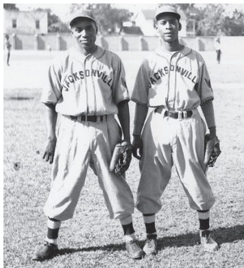
Jacksonville Negro Leagues players

Professional baseball in Jacksonville was founded in 1904, when the Jacksonville Jays became apart of the newly formed South Atlantic League. Jacksonville hosted the first South Atlantic League game on the Southside of Town at Dixieland Park, when the Jays defeated Macon, 1-0. At that time, there were no bridges in Jacksonville, so fans would have to ride ferries across the St. Johns River to attend a game at Dixieland Park.