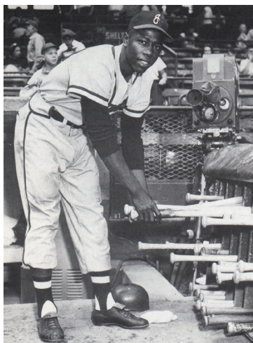
Hank Aaron as a 1953 Jacksonville Brave

Jacksonville Braves. Along with new ownership and name change, another great part of history happened as future MLB Home Run King Hank Aaron broke the South Atlantic League color barrier playing for the Braves. In his only season in Jacksonville, Aaron made a mark by recording a .362 average, with 22 homeruns, 36 doubles and 14 triples to earn League MVP honors. Aaron made his Major League debut a year later in 1954.