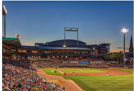
121 Financial Ballpark

The Suns played their final season at Wolfson Park in 2002 before moving across the parking lot to the then-newly constructed Baseball Grounds of Jacksonville in 2003. In the stadium's first season, the team set an attendance record of 359,979 and surpassed that record in 2005 as 420,495 fans walked through the gates.