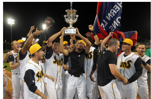
The Jacksonville Suns won three Southern League Championships in five years (2009, 2010 and 2014).

On November 2, 2016, a new chapter opened in Jacksonville baseball history as the franchise was renamed to the Jumbo Shrimp. As Florida's largest city, yet in