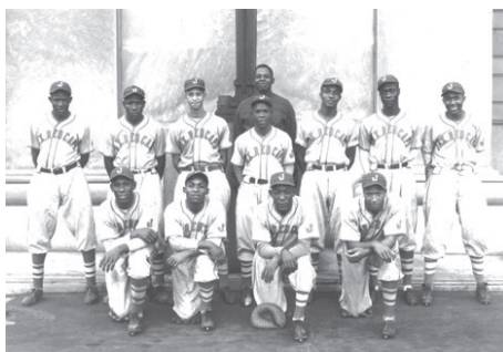
Jacksonville Red Caps

Jacksonville joined the Negro League ranks in 1938 as the Red Caps made their debut in the Negro American League. The team shared Barrs Field with the Tars. The Red Caps left after one season in 1939, but returned for the 1941 and 1942 seasons.