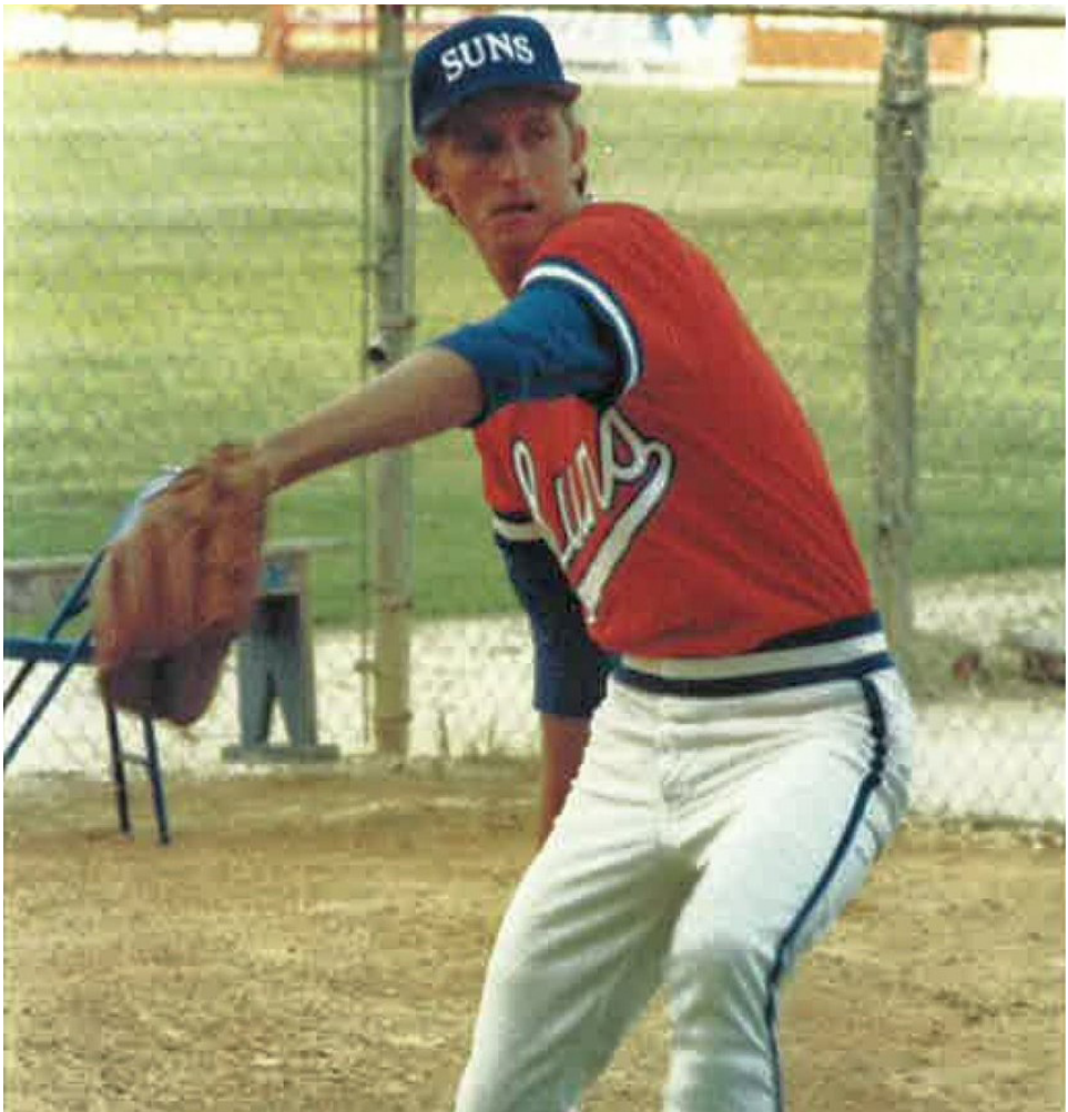
Though he never threw a no-hitter for Jacksonville, Bret Saberhagen tossed a no-hitter for the Kansas City Royals on August 26, 1991 in a 7-0 victory over the Chicago White Sox at Kauffman Stadium in Kansas City.